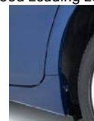
Rear Quarter Panel