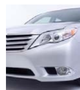
Hood Leading Edge