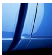
Bed Leading Edge